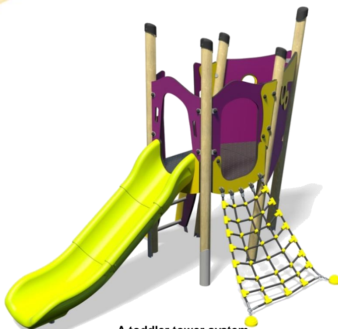
A toddler tower system comprising of: