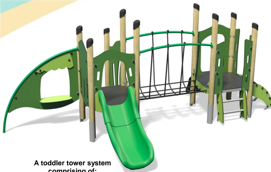
A toddler tower system comprising of: